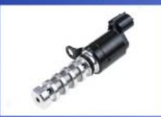
Oil Control Valve