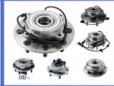
Wheel Hub Bearing