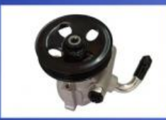
Power Steering Pump