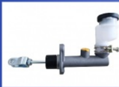
Clutch Master Cylinder