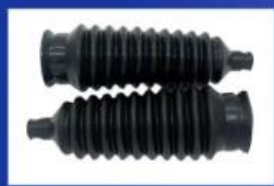
Steering Gear Boots