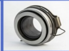
Clutch Release Bearing