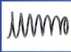
Shock Absorber Spring