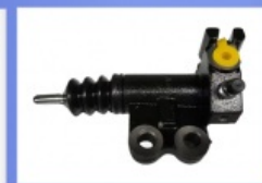
Brake Slave Cylinder