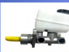
Brake Master Cylinder